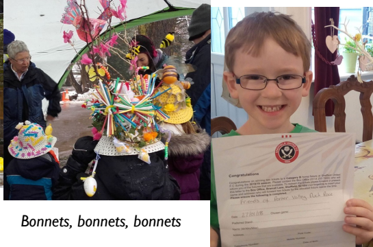
Bonnets, bonnets, bonnets