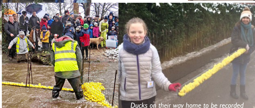
Ducks on their way home to be recorded