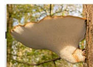
Dryad's saddle fungus