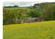
Summer meadow, Mayfield valley