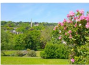
View across Bingham Park