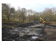
Forge Dam just a year ago