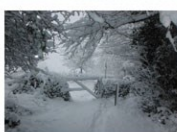
Missing gate, Porter Clough

You can buy cards and calendars at Endcliffe Park Café, Forge Dam Café and Le Crunch at Bents Green, or they are available online. We sold several packs to early bird Christmas shoppers at our Open Meeting in August, and plan to have both cards and calendars available at the AGM on November 2 nd .