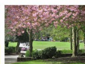
Cherry Blossom, Endcliffe Park