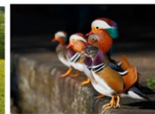
A line of Mandarin ducks