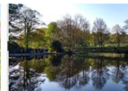
Wiremill dam, dawn bird walk