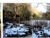
Bullrushes, Forge Dam