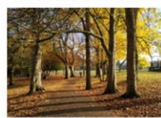
Autumn walk, Endcliffe Park