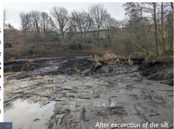
After excavation of the silt

By mid-March, all the silt that was planned to be removed had been taken to the Beighton Tip—some 5,000 tonnes in all. The remaining material will be distributed to form a new bed profile. The training wall and associated channel is under construction from