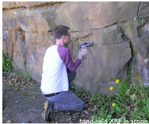
hand-held XRF in action

The Sheffield Area Geology Trust ( www.geologyatsheffield.co.uk/sagt ) promotes the conservation of geological sites and their uses for research. The Porter Valley has been used in the education of students at all levels, and for last year and this, we have liaised with Derby University to enable some of their BSc students to carry out their personal mapping studies for their dissertations. Last year, one student worked the length of the valley from Brown Edge to Hunter's Bar, whilst another studied the outcrop of the Greenmoor Rock (aka Brincliffe Edge Rock), including the quarry face in the Omega car park. Both have been awarded 2:1 for their dissertations. This summer, another student has just started studying the Rough Rock outcrop, which will take him to Brown Edge too.